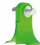
COLTKF7 Ø MAX 6 CM